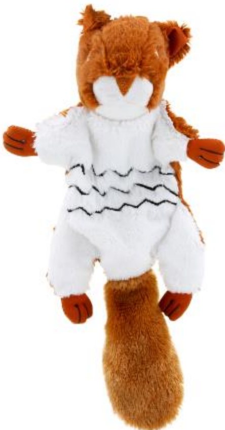
A soft animal