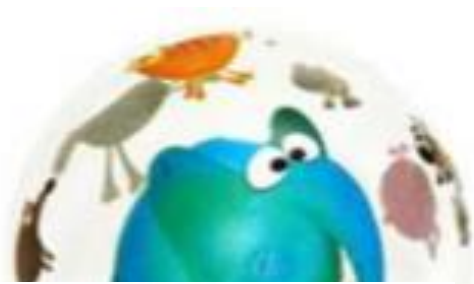
A light up ball

Or I can choose something fun from the sensory box to help me feel calm like: